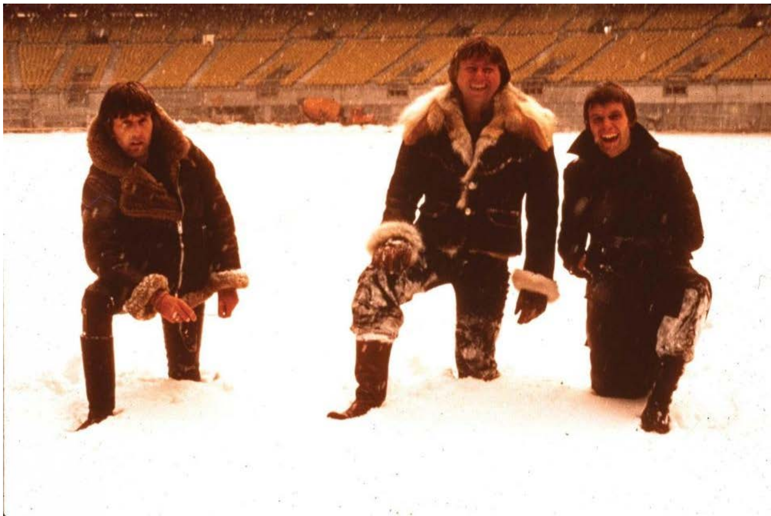
Emerson, Lake and Palmer