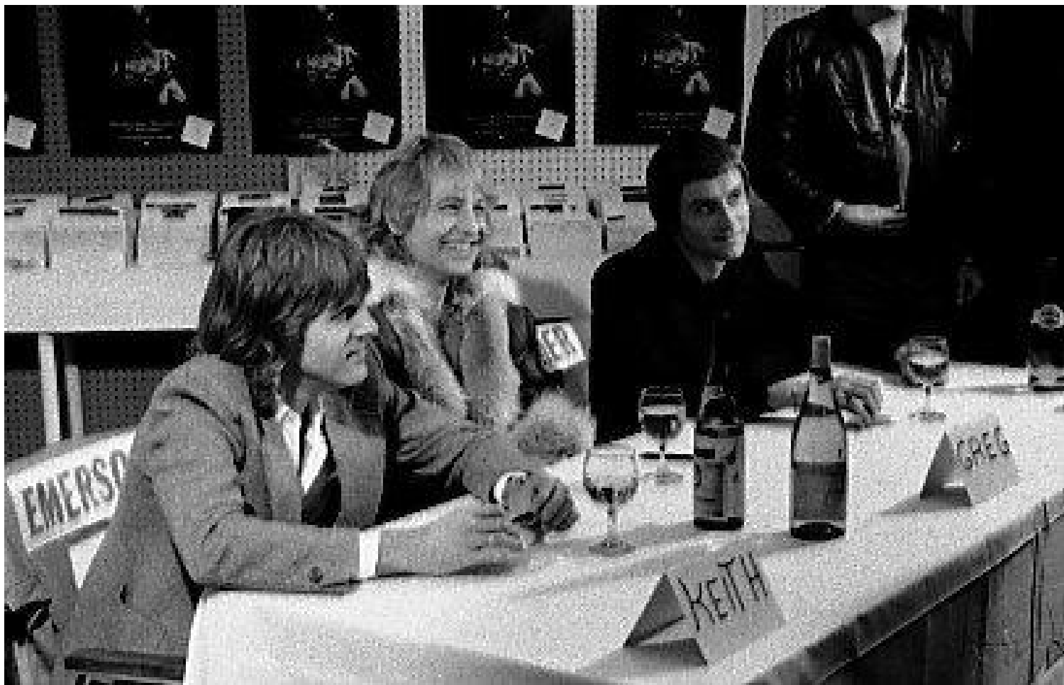
Emerson, Lake and Palmer in Toronto in early February 1978.