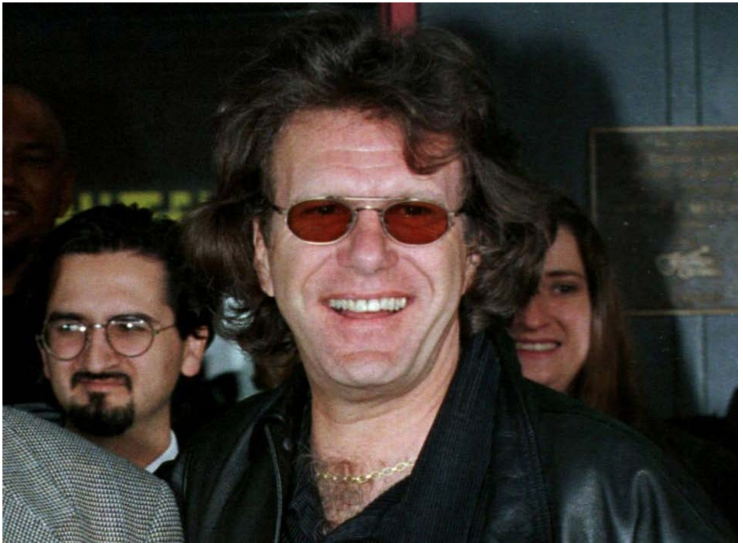
Keith Emerson at a handprints ceremony for singer Joe Cocker (not shown) in Hollywood, California, on April 1, 1998.