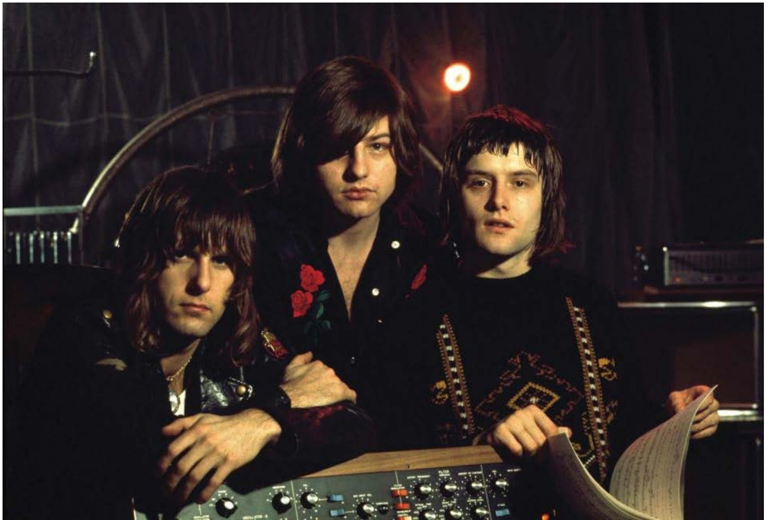
Emerson, Lake and Palmer