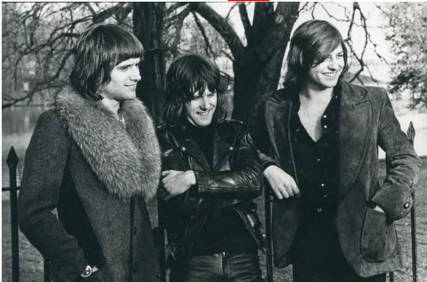
Emerson, Lake and Palmer

Lake: I think that was true. I think he was unique, with his whole approach to music. You know, well, it sort of verged on slight insanity. He pushed the limits of believability. He was absolutely original. Yeah, I think he defined modern keyboard playing. There's no one else I can personally think of that's left a stamp like that on keyboard music of the 20th century. Gershwin is another.