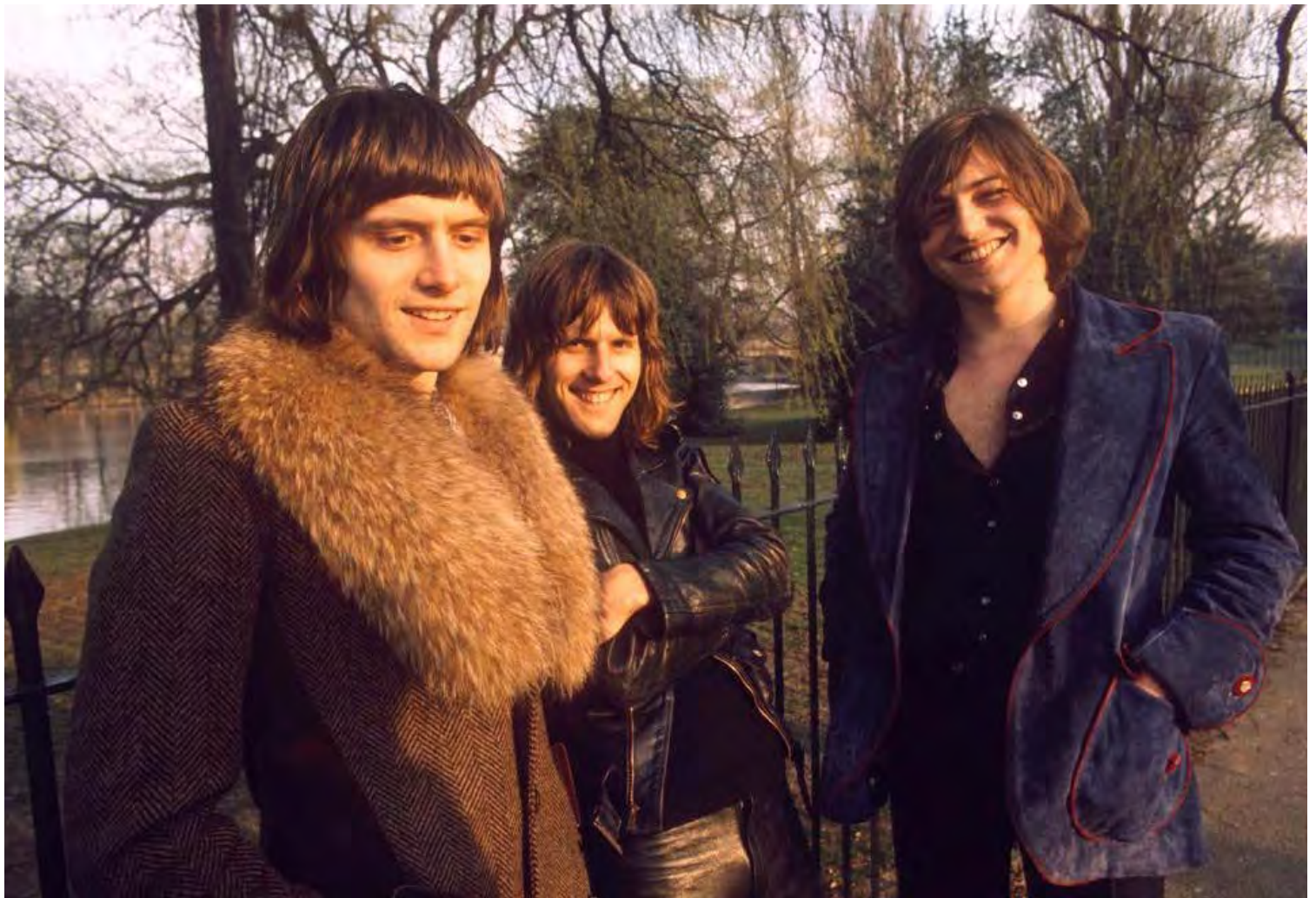
From left, Carl Palmer, Keith Emerson and Greg Lake.